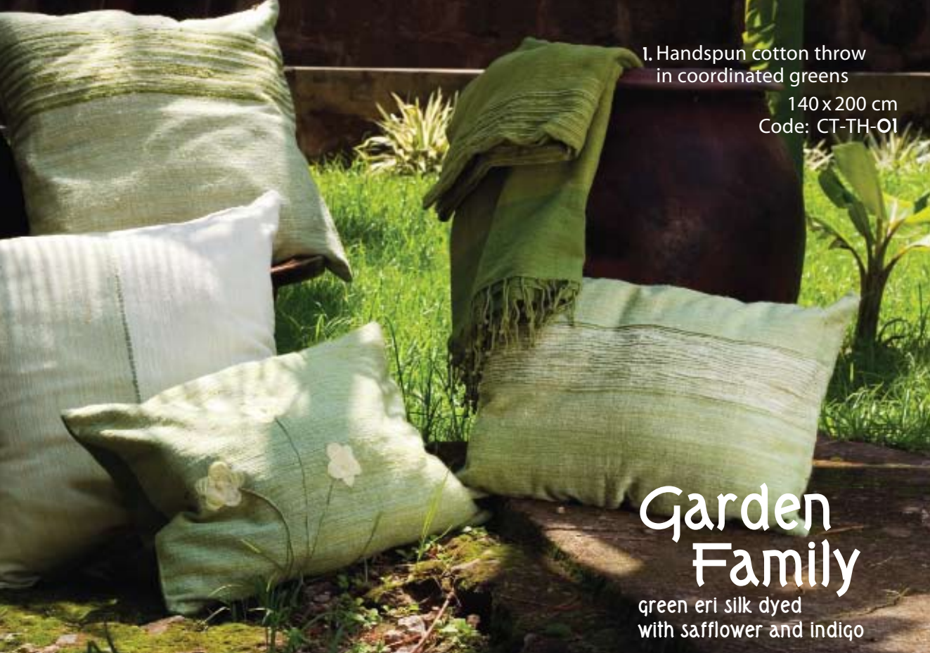
1. Handspun cotton throw in coordinated greens 140 x 200 cm Code: CT-TH-01